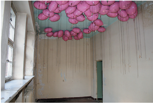
Figure 7. Parastou Forouhar, Sag mir wo die Menschen sind/Where have all the people gone? , installation with balloons and flash animation (in two rooms), Hannah Arendt Denkraum (Hannah Arendt Thinking Space) Exhibition.