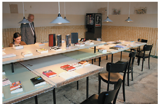
Figure 12. The reading room, Hannah Arendt Denkraum Exhibition (photo by author, 2006).