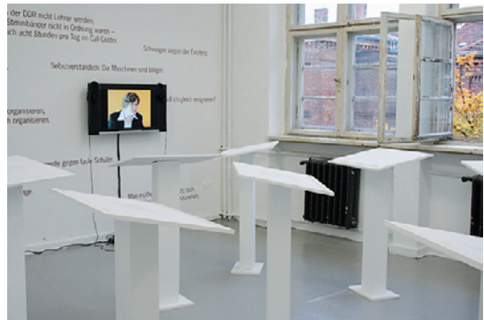
Figure 10. Judith Siegmund, A Vocation - Job - Daily Grind? Labor, Action and Work , installation with t.v. monitors and texts, Hannah Arendt Denkraum Exhibition (reprinted with kind permission of artist).