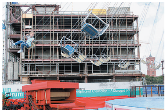
Figure 4. A market at the Schloßplatz.