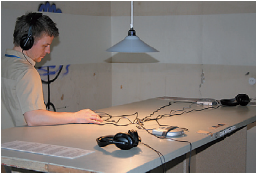
Figure 13. A listening room, Hannah Arendt Denkraum Exhibition.