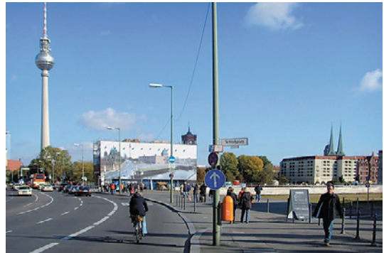
Figure 2. Schloßplatz, Berlin 2009 (©Frieder Schnock, Berlin / ARS, NYC).