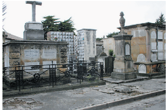
Figure 16. Spaces of the dead in Bogotá: The cemetery for the wealthy (photo by author, 2009).