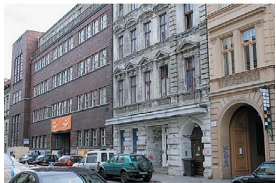
Figure 6. The former Jewish Girls School on Auguststrasse (to the left).