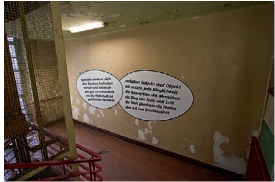
Figure 14. Arendt Hypertext in the school's stairwells, by artist Adib Fricke, The Word Company, Can't simulate freedom (Kann Freiheit nicht simulieren) , Hannah Arendt Denkraum Exhibition, Berlin 2006 (reprinted with kind permission of artist).