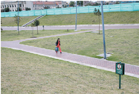
Figure 15. Bogotá's new green spaces: Millennium Park.