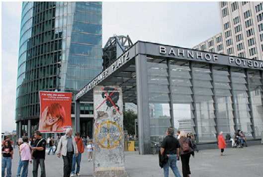
Figure 1. The New Berlin (photo by author, 2006).