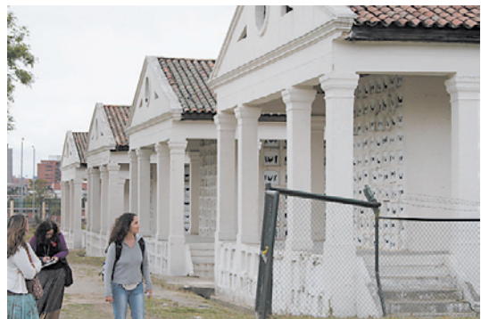
Figure 18. Almas Anonimas (Anonymous Souls) by artist Beatriz Gonzales; 8957 hand-painted images using stencils in four mass-crypt structures.