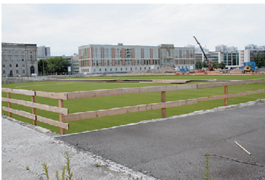
Figure 5. The empty lot left by the Palast (photo by author, 2009).