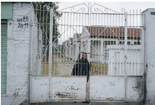
Figure 17. The former cemetery for the city's underclass (photo by author, 2009).