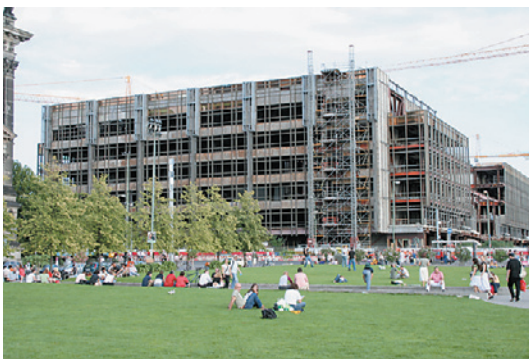
Figure 3. The GDR Palace of the Republic being "dismantled, not demolished".